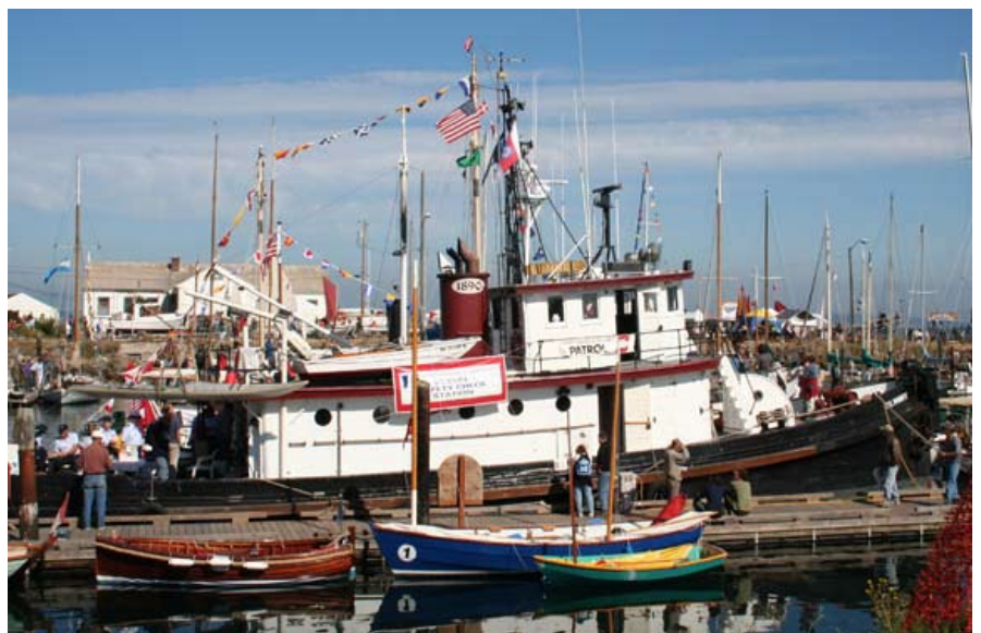
WBF 2005: Photo, Loretta Rindal