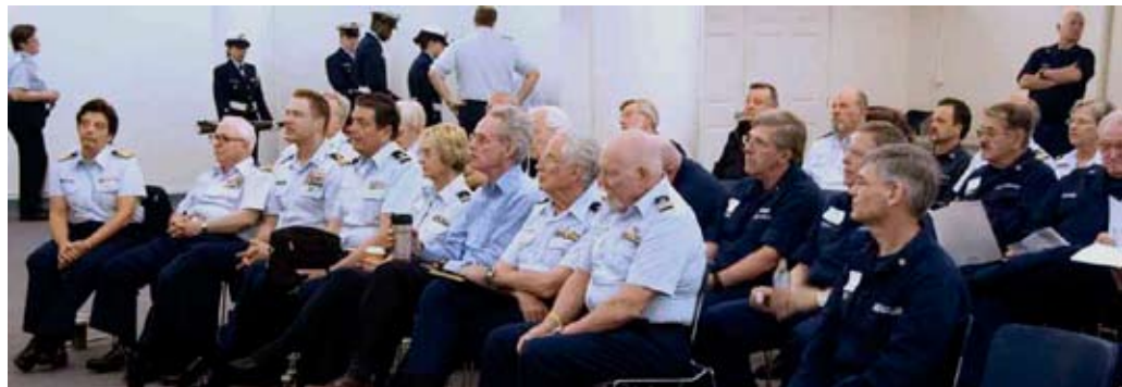
FL 48